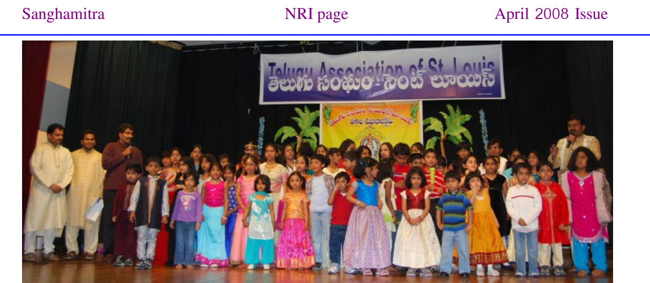
While singing Jana Gana Mana