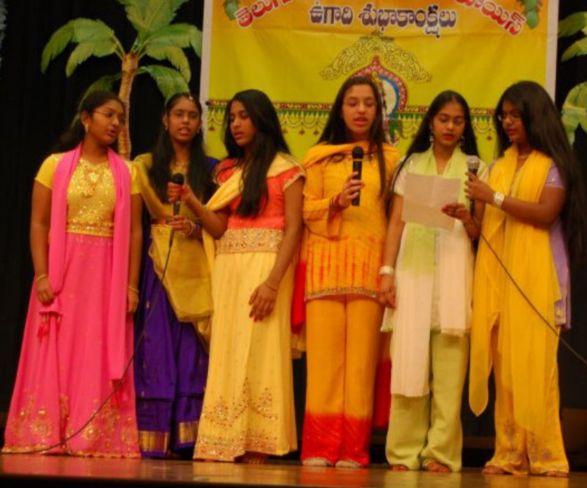
While singing Annamacharya Keertan

performed classical dances Bharatanatyam & Mohiniattam, folk dances and dance for movie songs. The comedy skit "Bhadram – Be careful" kept audience smiling. Certificates and Trophies were distributed at the end of the event to all the performers. All volunteers were appreciated by the committee for their hard work in making the event a wonderful one.